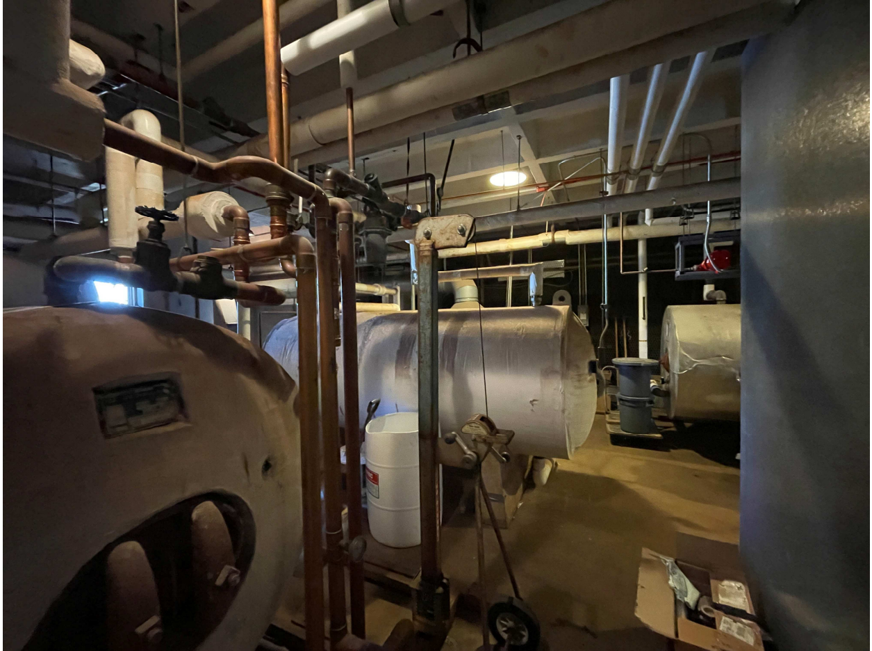
Photo: Storage tank in room.