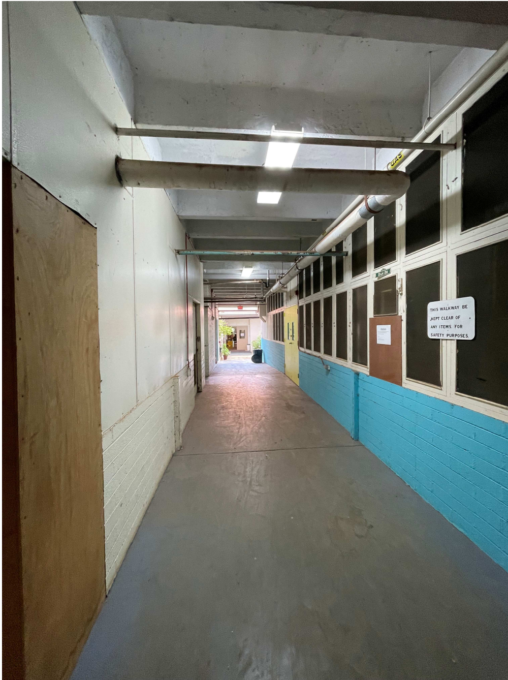
Photo: Hallway to heat pump room.