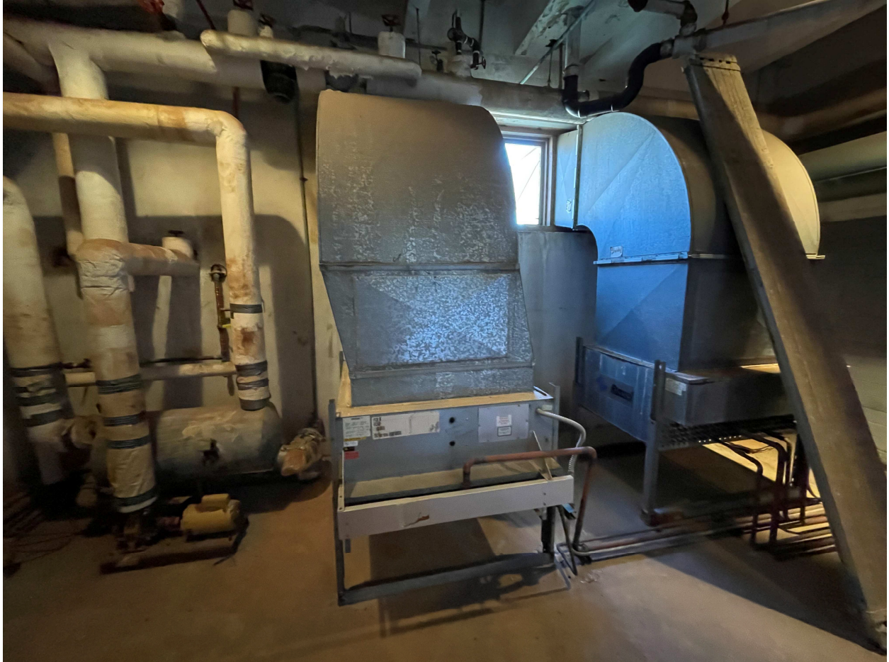
Photo: Storage tank in room.