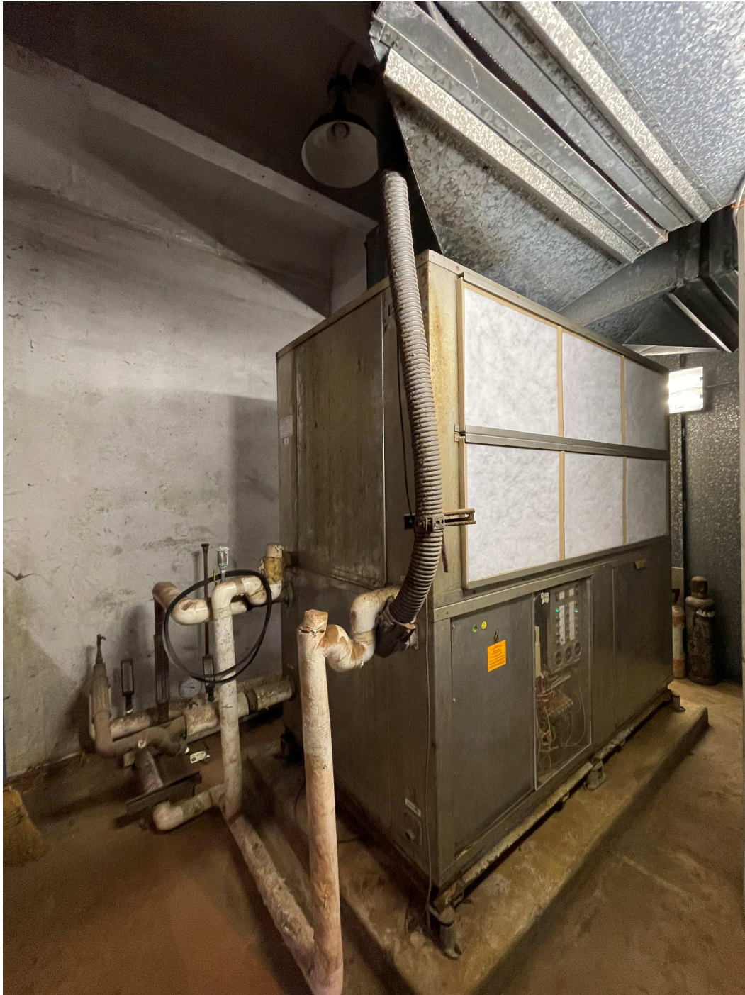
Photo: Heat pump in room.