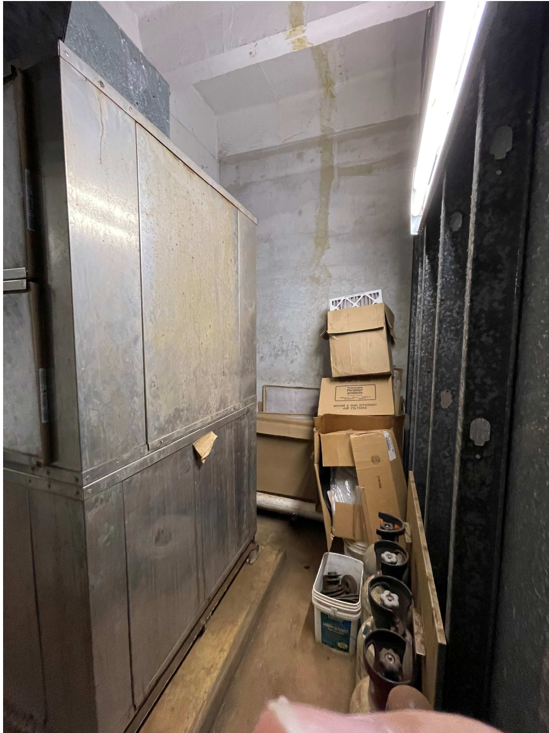
Photo: Heat pump in room.